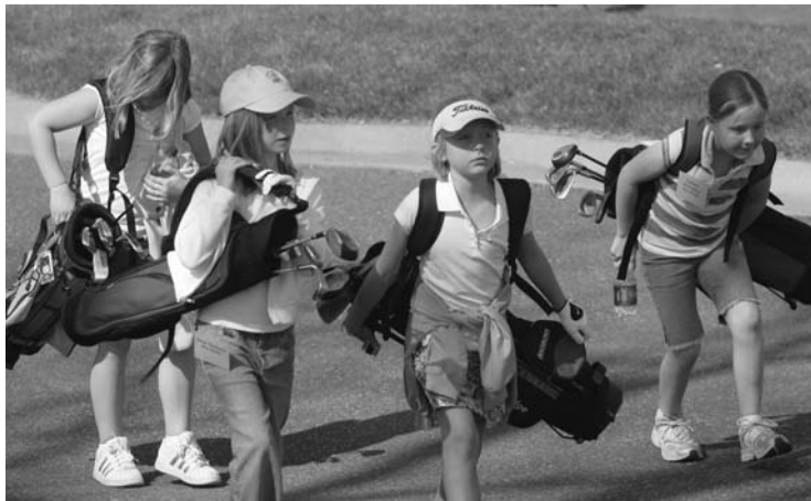
Girls making the move between stations at the clinic

What a rush (no pun intended)! On a beautiful April Saturday morning, an overwhelming turnout of nearly 250 girls attended the first Junior Girls Skills and Rules Clinic at the Academy at Rush Creek Golf Course. During this outstanding free clinic, the girls participated at five stations: putting, short game, driving, rules and etiquette. Clinic instructors included six PGA MN Section professionals, premier women golfers and MWGA rules officials.